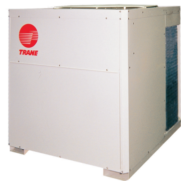
Condensing Unit TTA 075-120