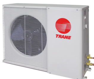
Condensing Unit TTK 036-042

The auto vertical vane swing can be selected by pressing the SWING button.