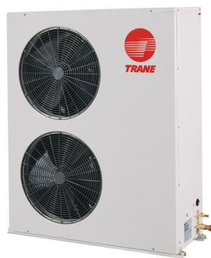
Condensing Unit TTK 048-060